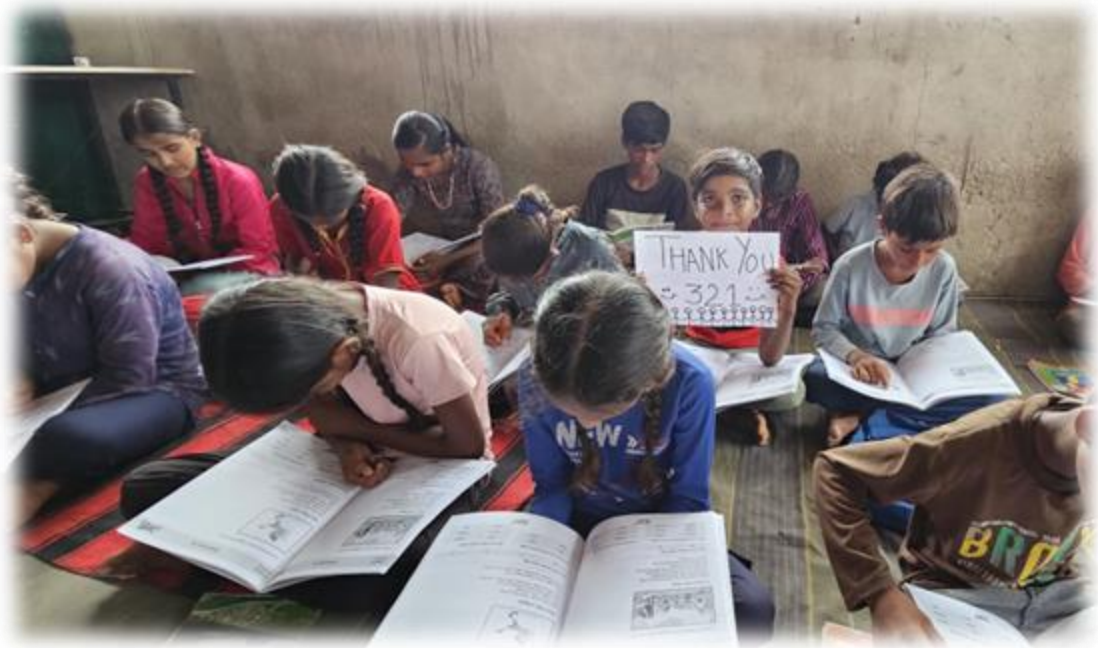
Representative photo *Name changed