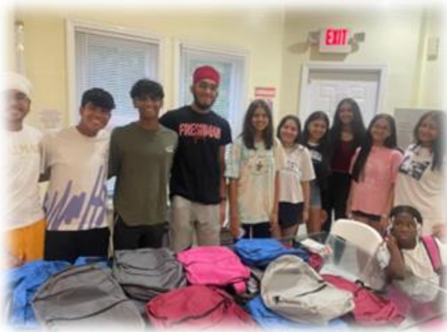
Backpack sorting and distribution

From creative fundraising, team building events, and spreading awareness, CH3 members are resolute in their mission to serve underprivileged children in their own communities. With the funds raised, the teams distribute backpacks, toiletries, non-perishable food, gift cards, and toys. Besides this, funds also serve to send children for summer camps which helps them gain valuable and varied experiences.