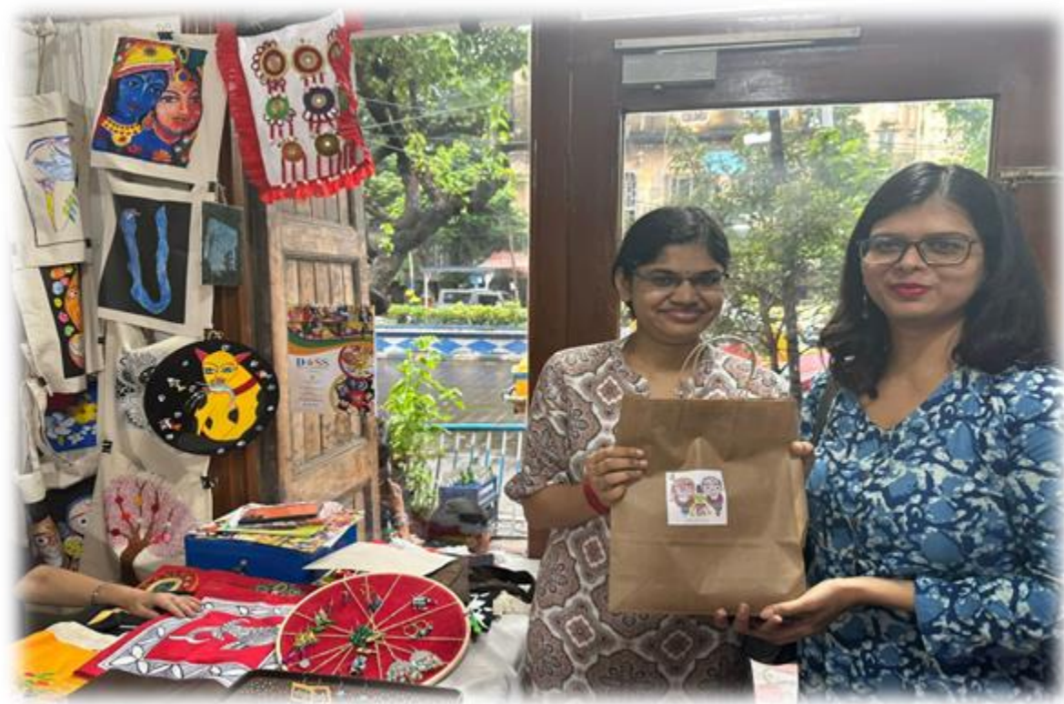
Representative photo *Name changed